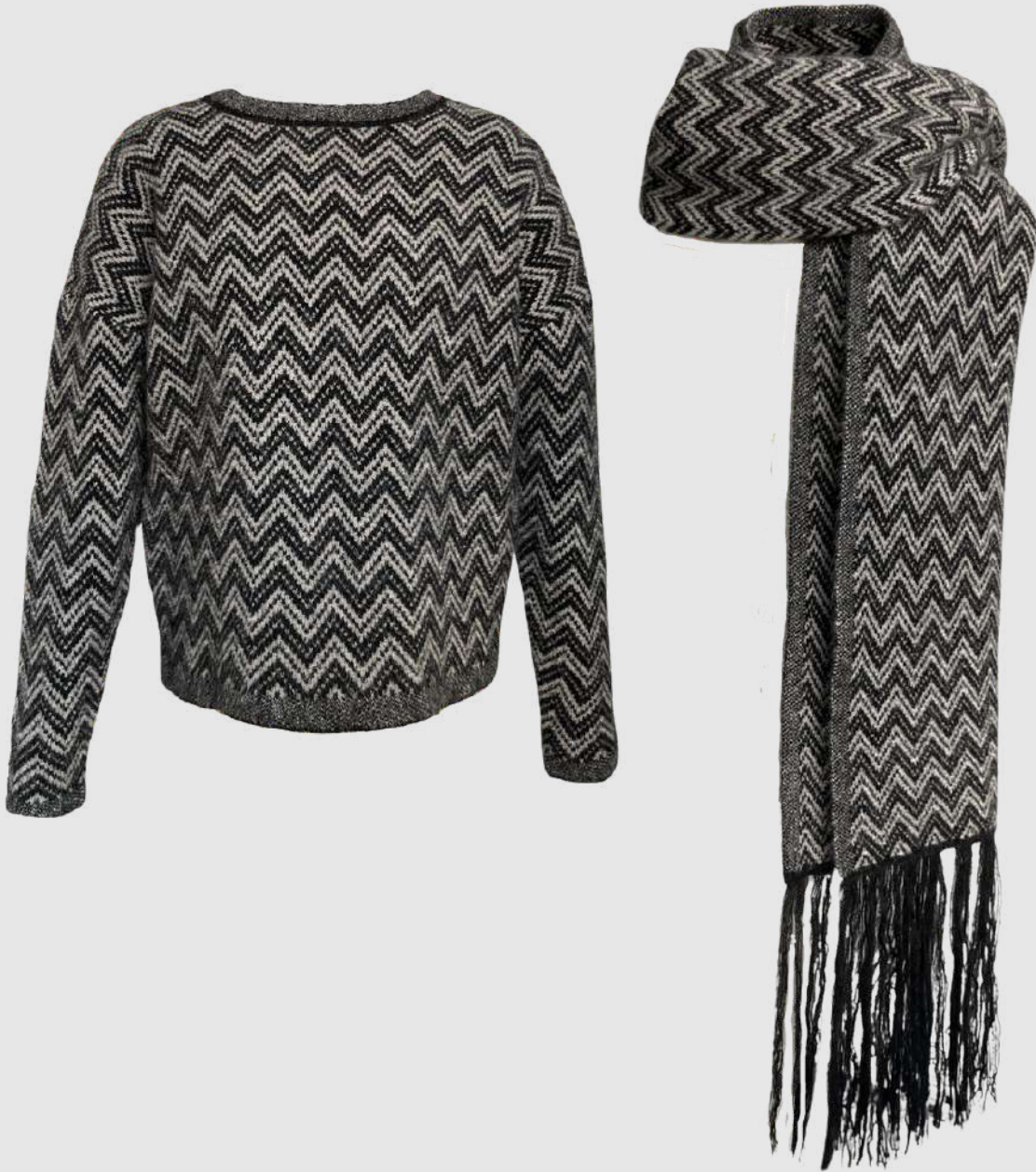
Pullover Lava , 5-16016-65, Fishgrat Grey, 38% Mohair, 38% Wolle, 19% Polyamid, 5% Elasthan Schal Kass , 5-11011-66, Fishgrat Grey, 38% Mohair, 38% Wolle, 19% Polyamid, 5% Elasthan